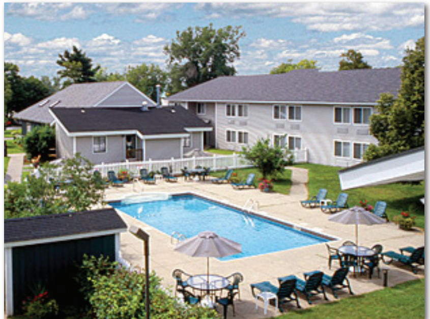
Windjammer Inn & Conference Center • 1076 Williston Rd. • S. Burlington, VT