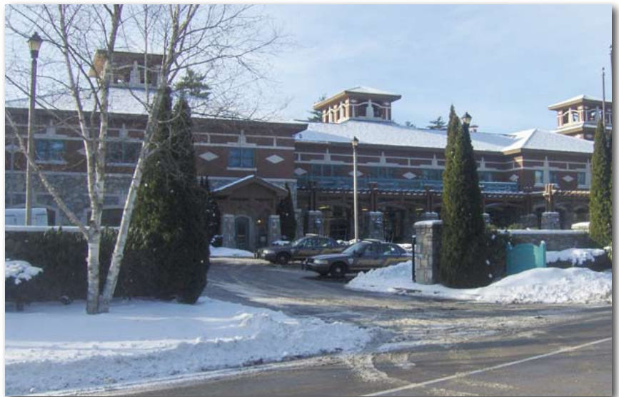
Mashantucket-Pequot Tribal Nation Public Safety Bldg