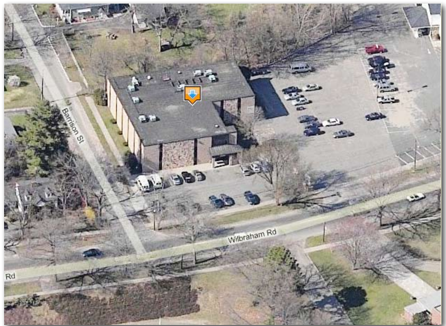
The Safety Council of Western New England • Springfield, MA

CT ABC/Construction Education Center is suite 104