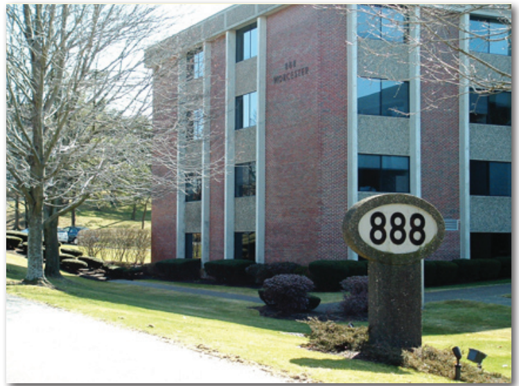
Associated General Contractors of MA • Wellesley, MA