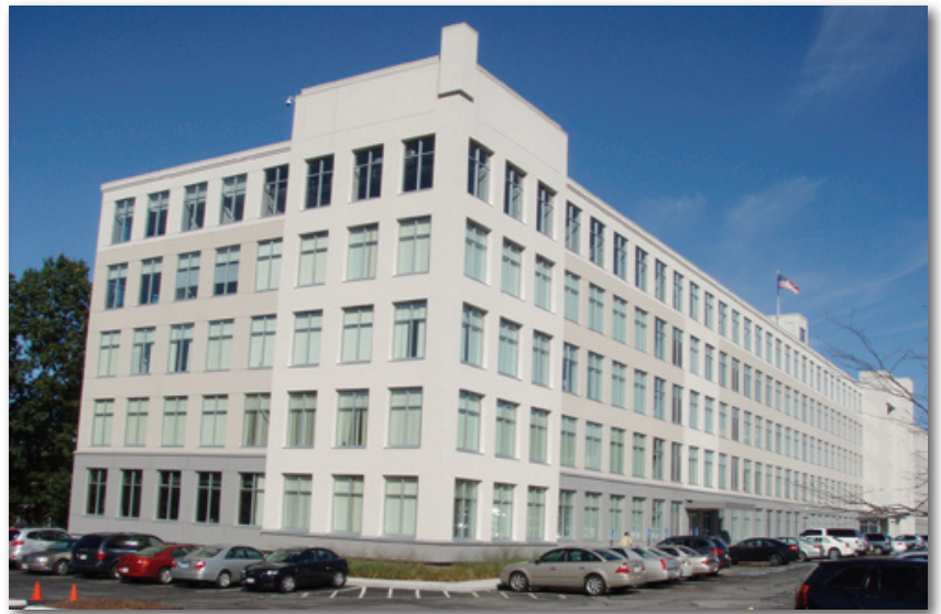
Employers Association of the Northeast • 67 Millbrook St., Suite 208